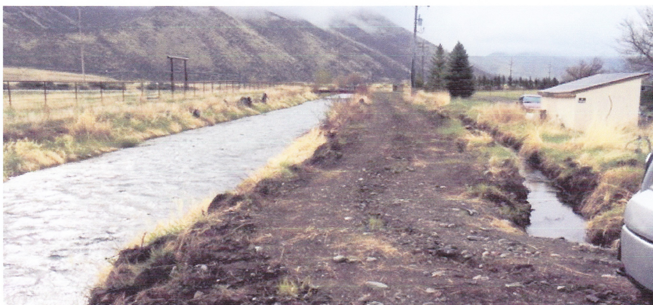
Right of Way clean up just below Ed's Drop at Matt Thornton's We doubled the amount of easily accessible bank on this stretch, which will make any nearby maintenance much easier.