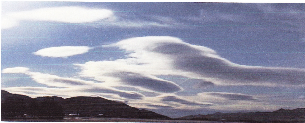
Cold, high winds, in mid April