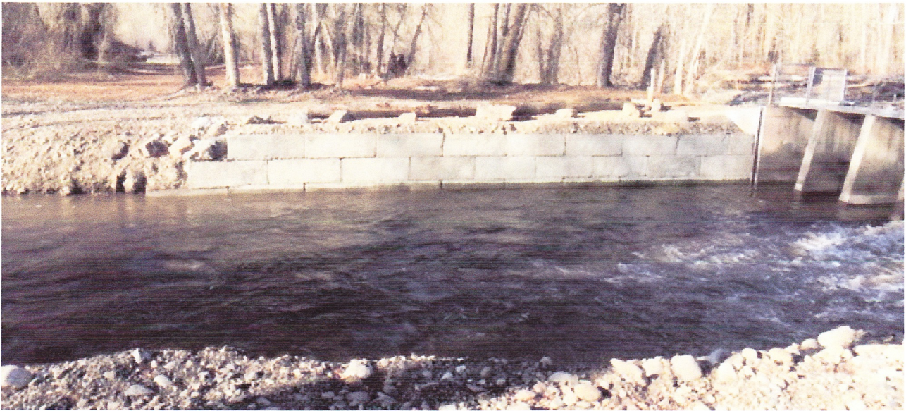
Our Fall improvement in The Preserve Just below the Mains

Any questions or ideas, don't hesitate to call or stop by, where ever you see me, out there.