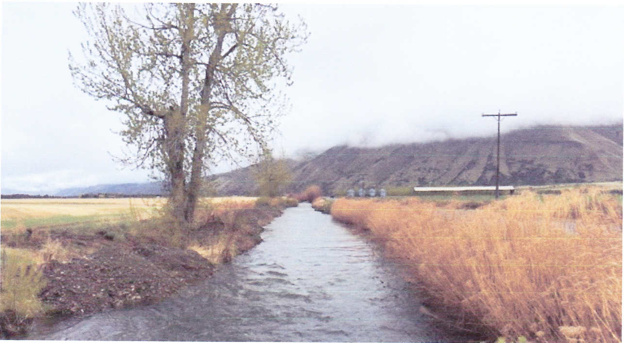
Last day of large volume gravel removal Early April and then, yesterday. Upper Kingsbury. Donated equipment.