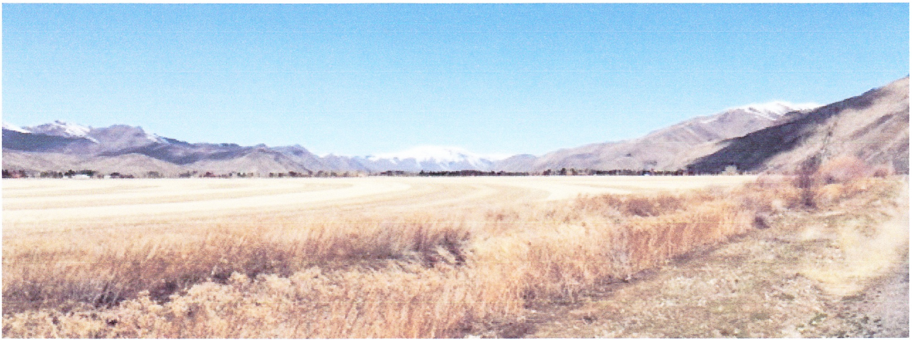
April 2 One of those early season, cold days, on my summer job, split between my last few days of my winter work on Baldy.