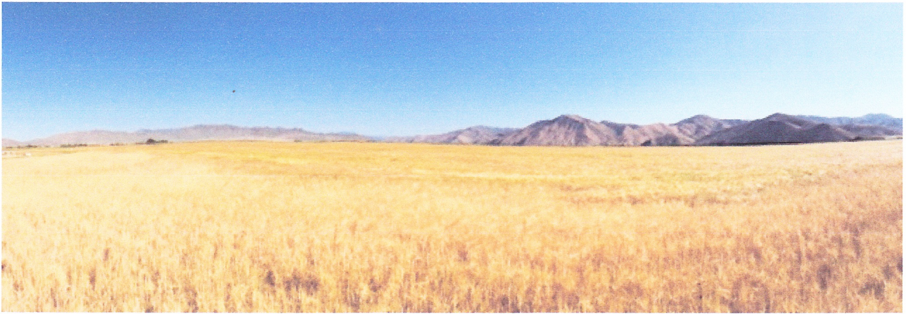
the color of August